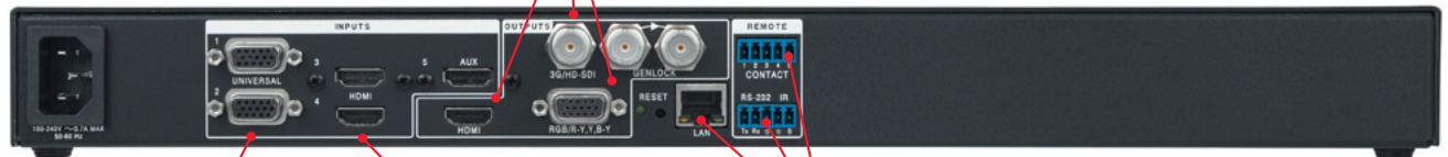
DVS 605 D - Back

Selectable output rates are available up to 1920x1200, including HDTV 1080p and 2048x1080.