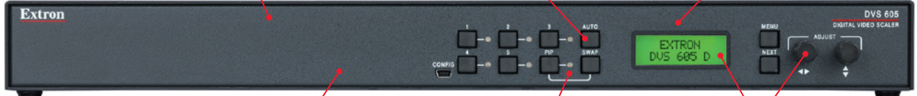
DVS 605 D - Front

High quality graphics and video upscaling and downscaling, 1080i deinterlacing, and HDMI Deep Color processing.