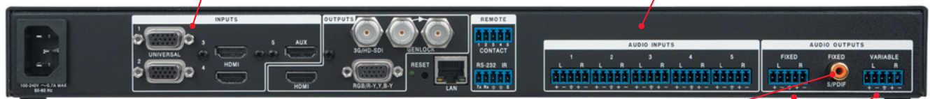
DVS 605 AD - Back

Balanced and unbalanced audio switching to accompany the video input sources.